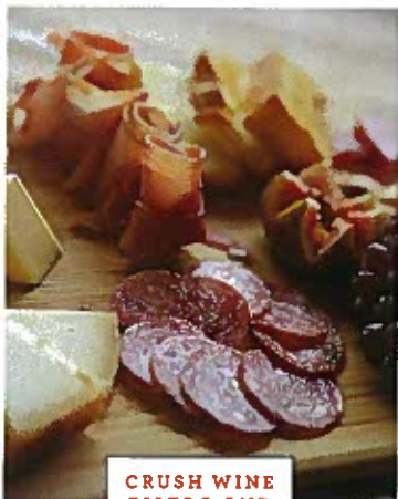
CRUSH WINE BISTRO AND CELLAR