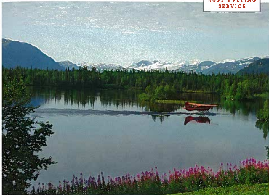
RUST'S FLYING SERVICE