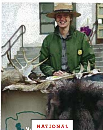
NATIONAL PARK RANGER